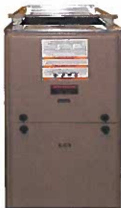
Downflow with top return