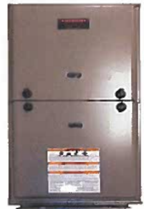
Upflow with bottom return