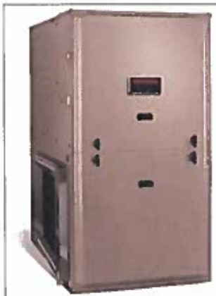
Upflow with side return